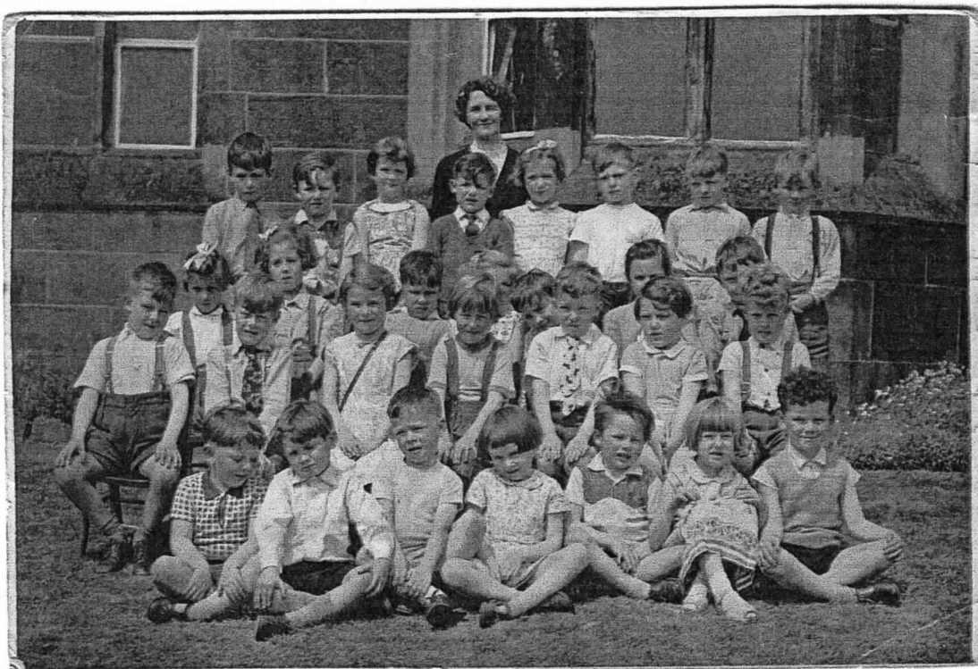
Can you name these children?